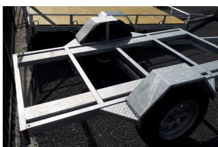
Laser cut and folded 4mm Steel Channels for Mounting Pumps or Compressors