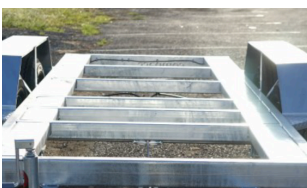
Heavy duty chassis structure