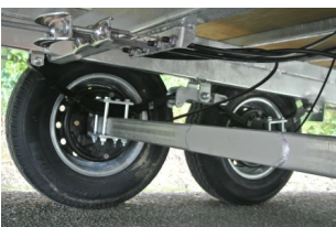
European Brakes Both Axles