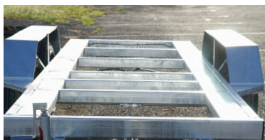
Heavy duty chassis structure