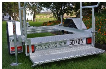
Fold down steps