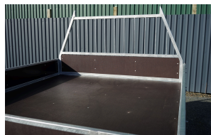
One piece high density 12mm Transtex decking