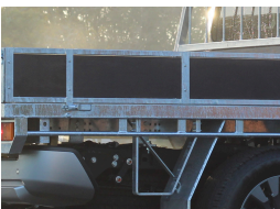
Steps and tie rails